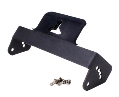
Mounting Bracket MB2750SCK