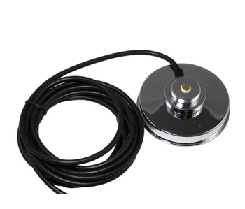
Universal Mobile Antenna Mount G8PI