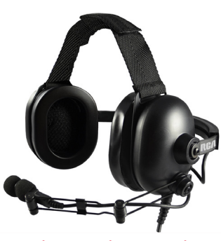
High Noise Behind the Head Headset HS75NR-X03S