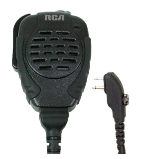
Heavy Duty Speaker Mic SM310-X03S