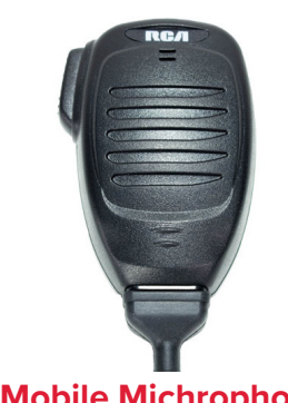
Mobile Michrophone MM301HD