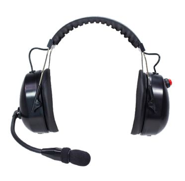
High Noise Over the Head Headset HS65NR-X03S