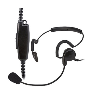
Light Duty Behind the Head Headset HS12-X03S